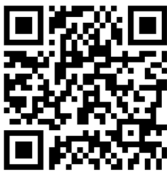
Step 1 & 2